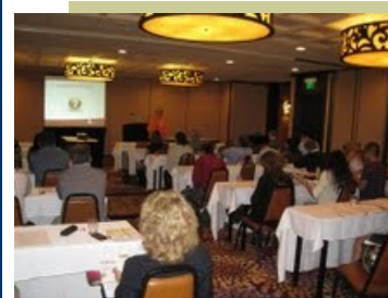
Drug Shortages Presentation