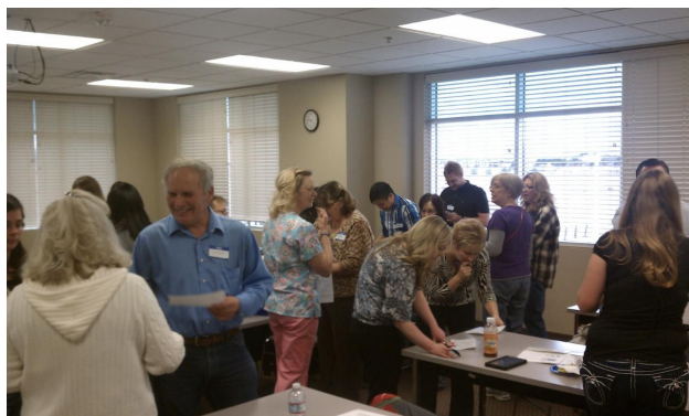
NVSHP Technician Workshop: Bingo Mixer

Thank you to all of the presenters and attendees for making this event a huge success!