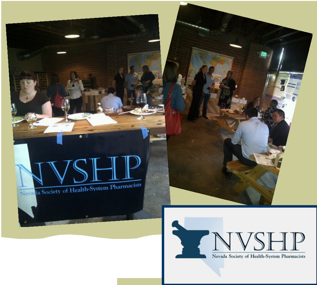
Northern Nevada Membership Mixer