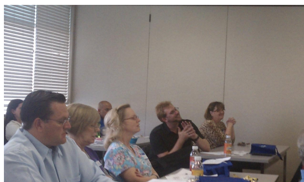
2012 NVSHP Technician Workshop in Reno, NV