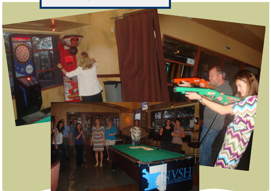
Southern Nevada Membership Mixer