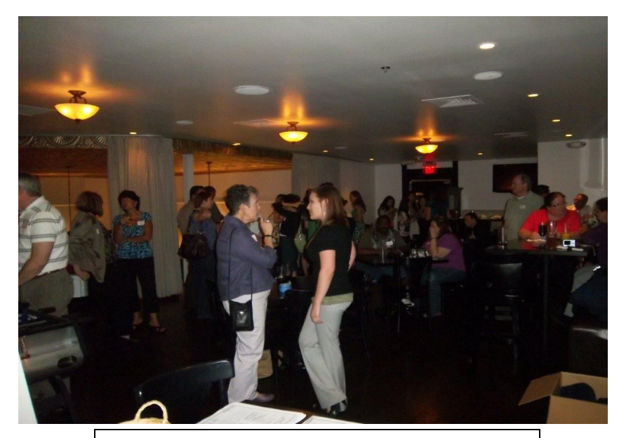
NVSHP social mixer at Republic Kitchen